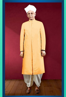
OUR INSPIRATION DR. S. RADHAKRISHNAN